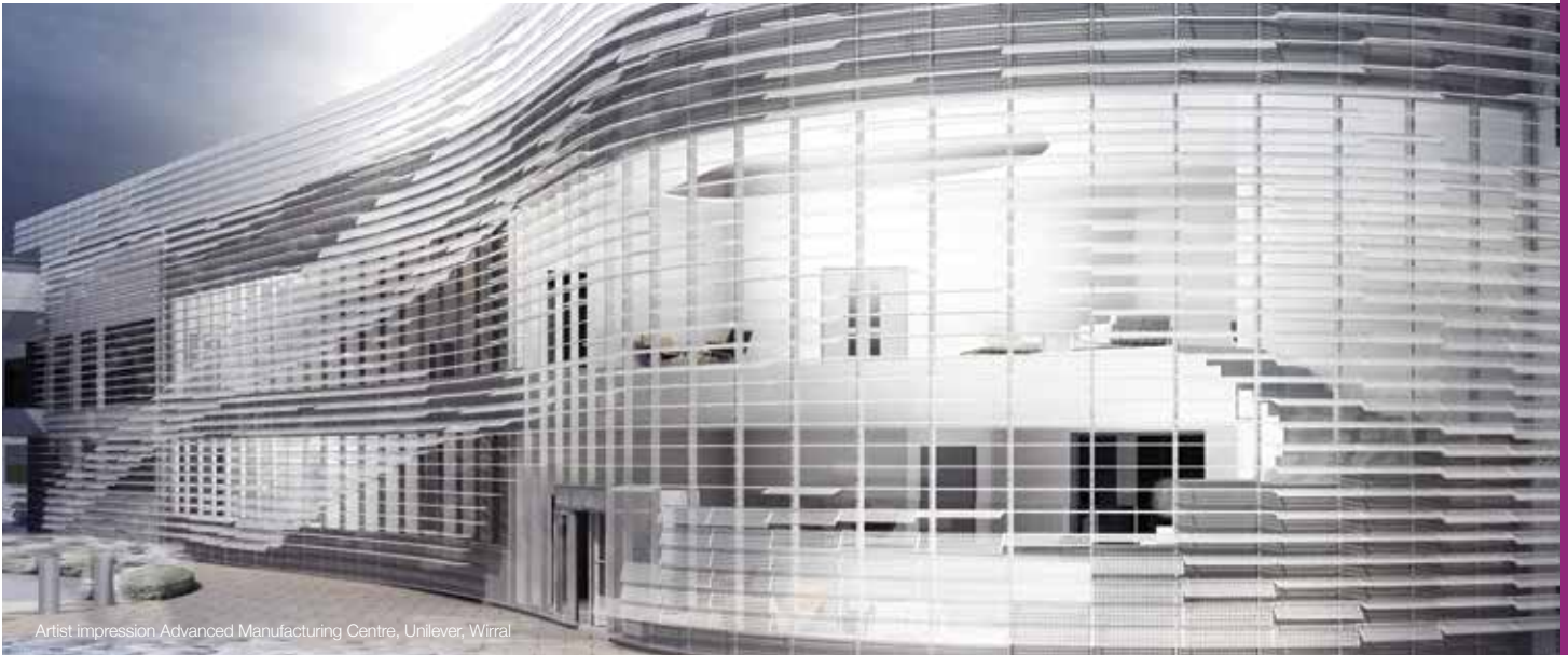
Artist impression Advanced Manufacturing Centre, Unilever, Wirral

Our strategic approach to addressing our challenges and realising the City Region's economic potential is focused on three strategic pillars: Productivity, People and Place.