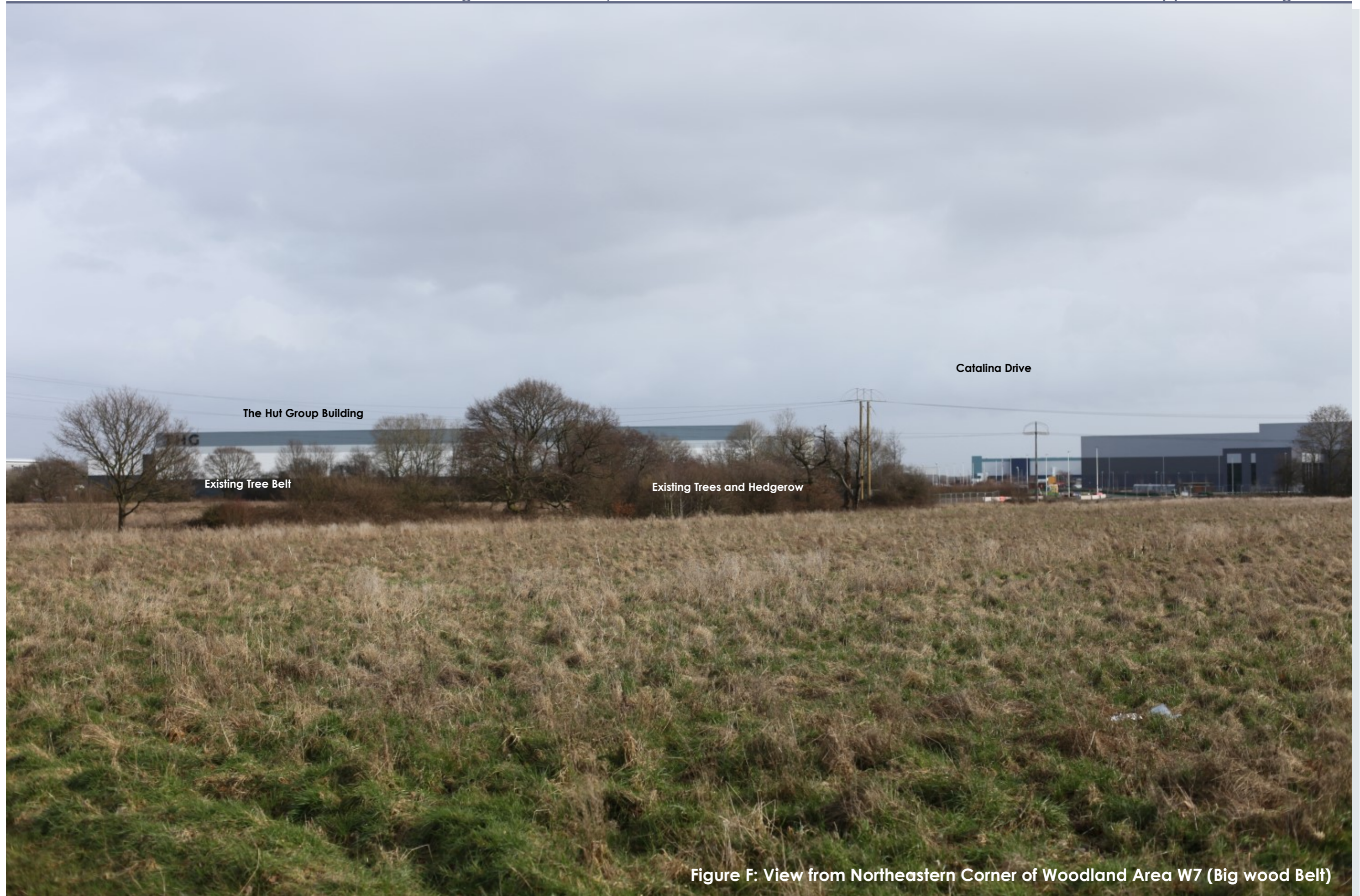
Figure F: View from Northeastern Corner of Woodland Area W7 (Big wood Belt)

Grid Reference: E710969 N400583 Camera: Canon EOS 5D Mk II Focal Length: 50mm Camera Height: 1.5m Date: 17/02/2021 Time: 14.00