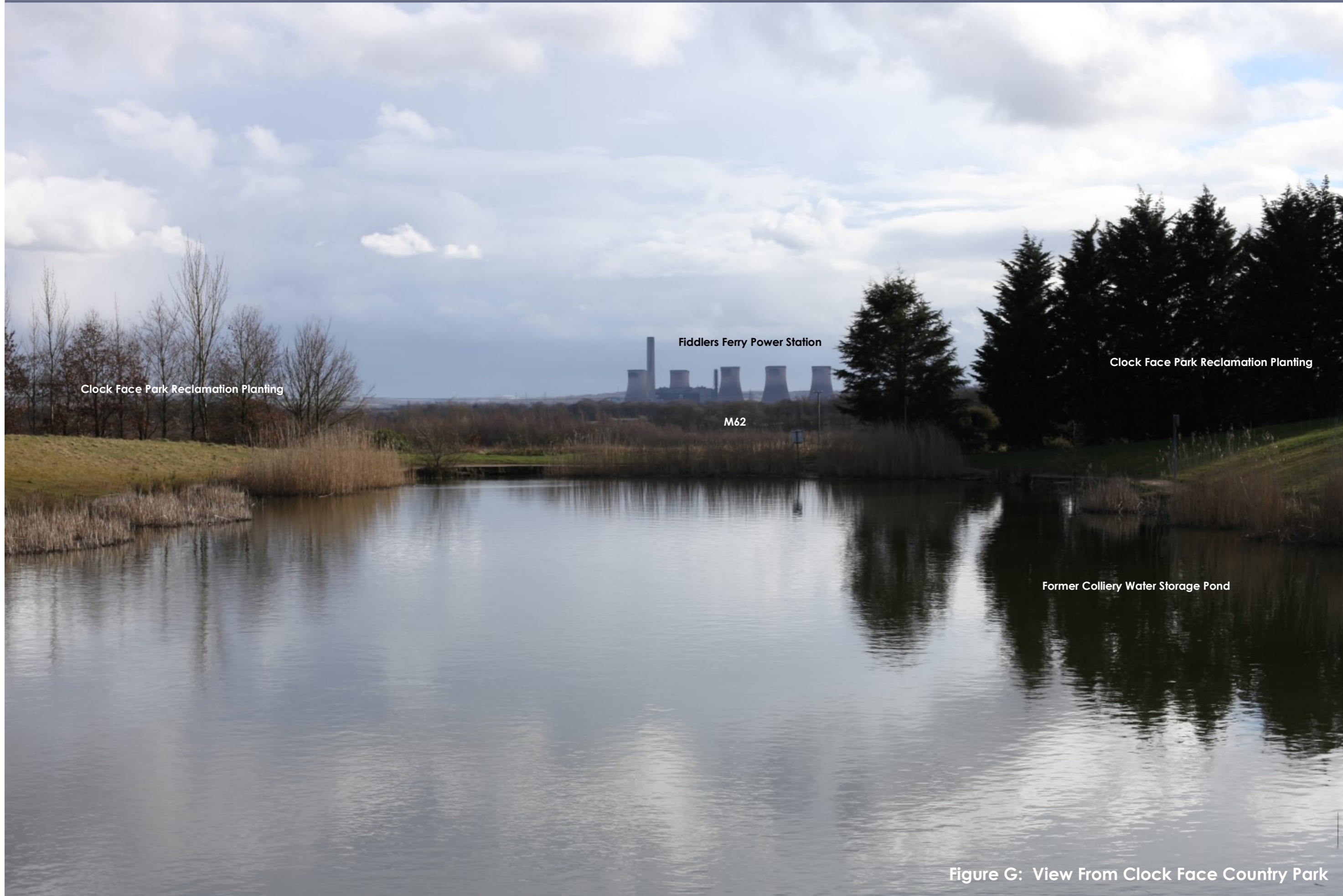
Figure G: View From Clock Face Country Park

Grid Reference: E712350 N401543 Camera: Canon EOS 5D Mk II Focal Length: 50mm Camera Height: 1.5m Date: 11/03/2021 Time: 16.34