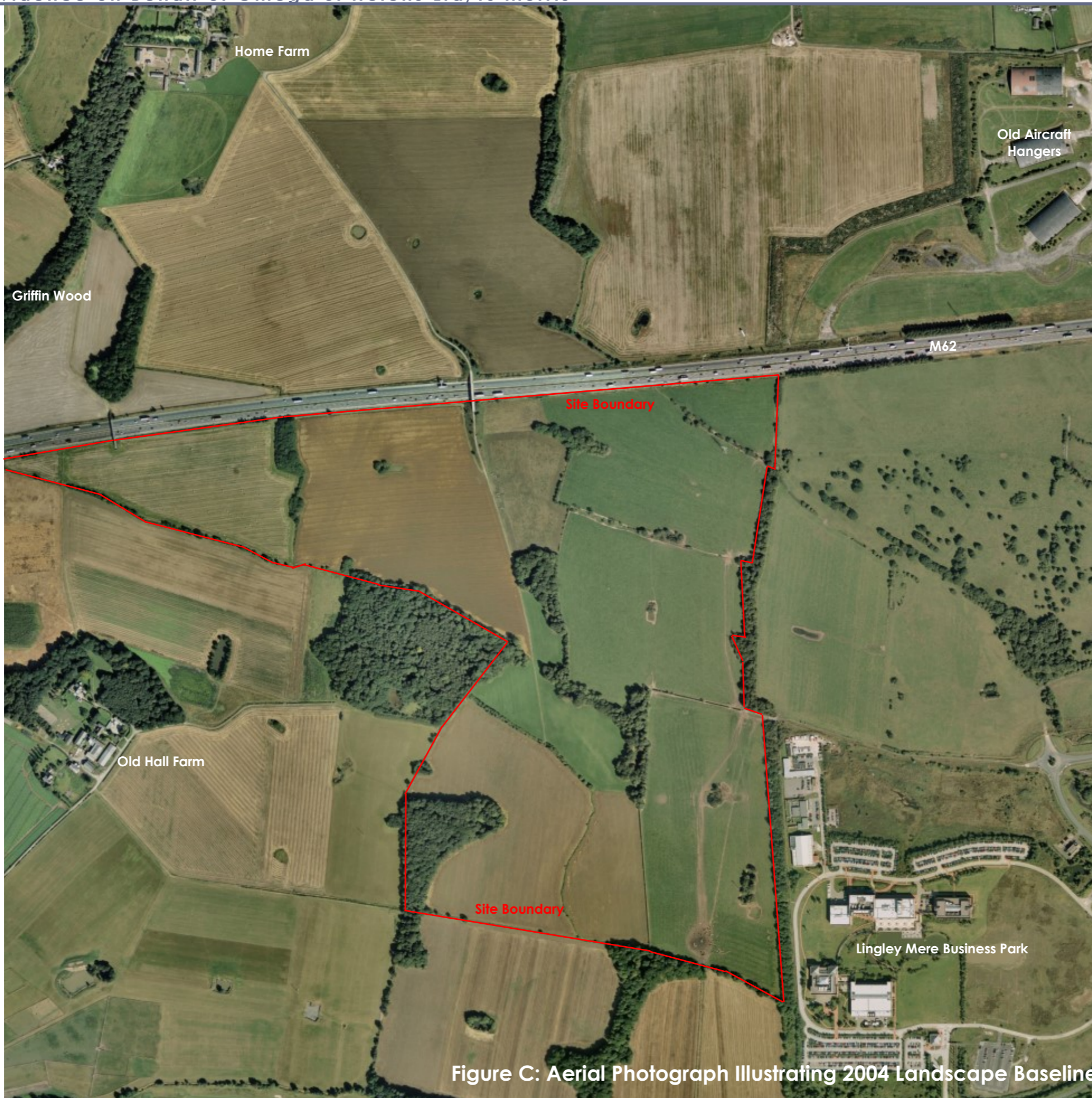
Figure C: Aerial Photograph Illustrating 2004 Landscape Baseline