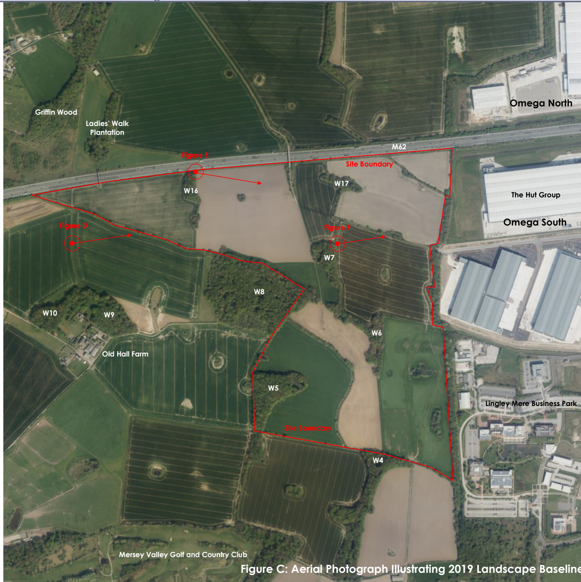
Figure C: Aerial Photograph Illustrating 2019 Landscape Baseline