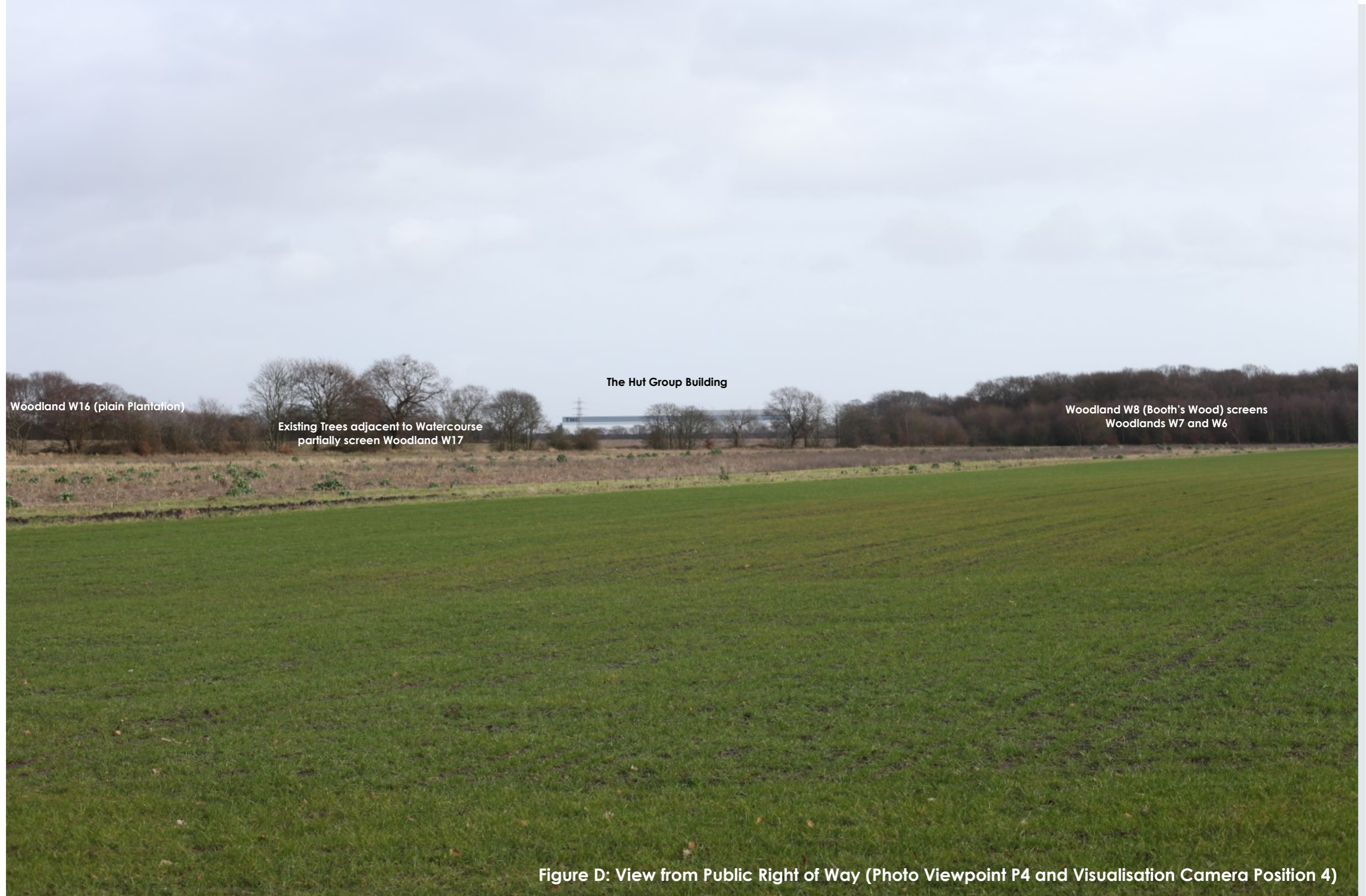
Figure D: View from Public Right of Way (Photo Viewpoint P4 and Visualisation Camera Position 4)

Grid Reference: E711856 N400611 Camera: Canon EOS 5D Mk II Focal Length: 50mm Camera Height: 1.5m Date: 17/02/2021 Time: 14.30