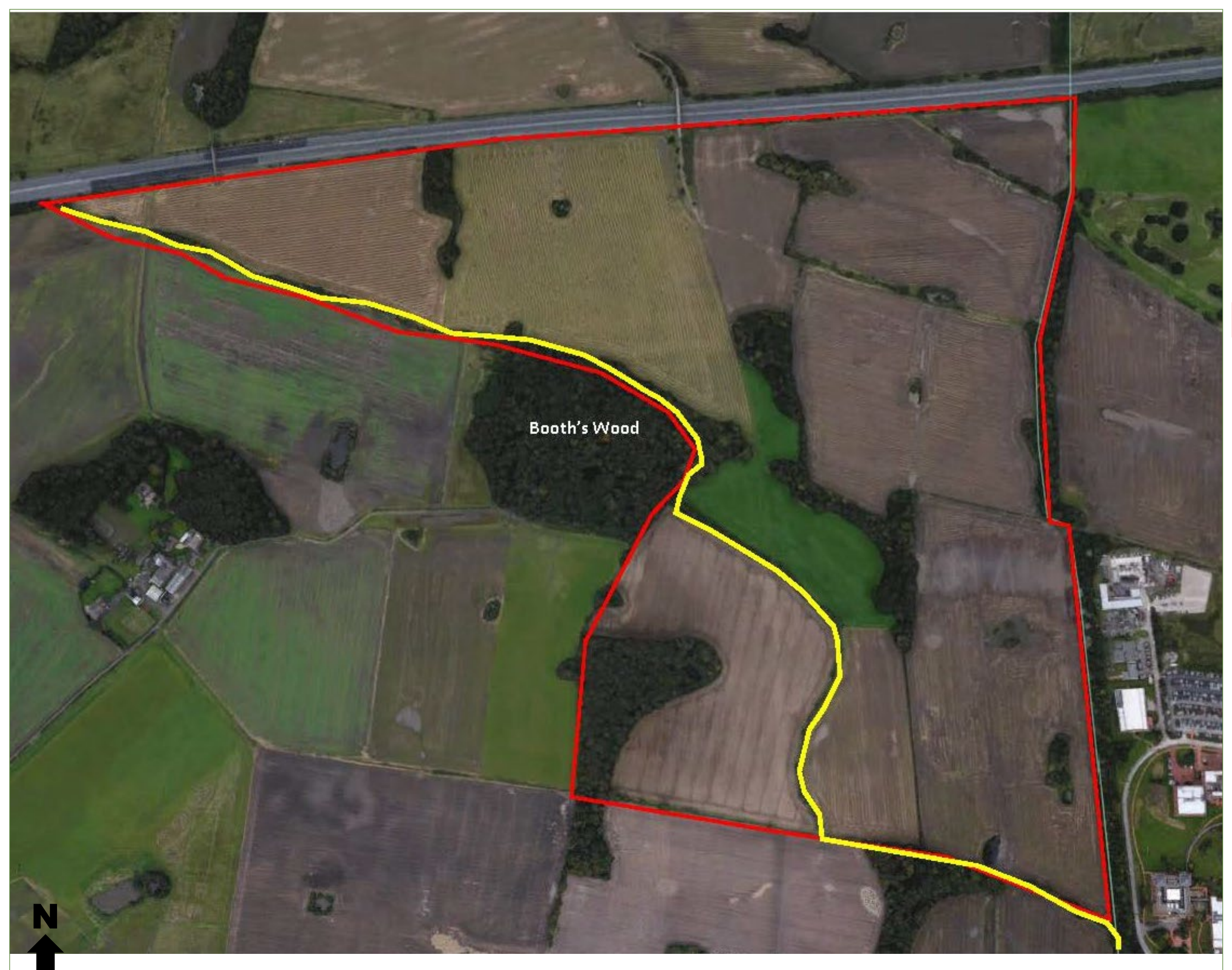
Figure 2 White-clawed