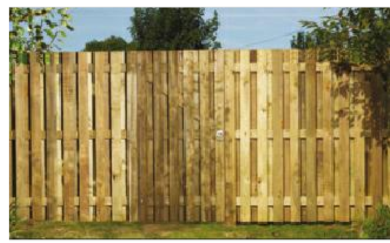
PHOTO OF TYPICAL HIT & MISS TIMBER FENCE