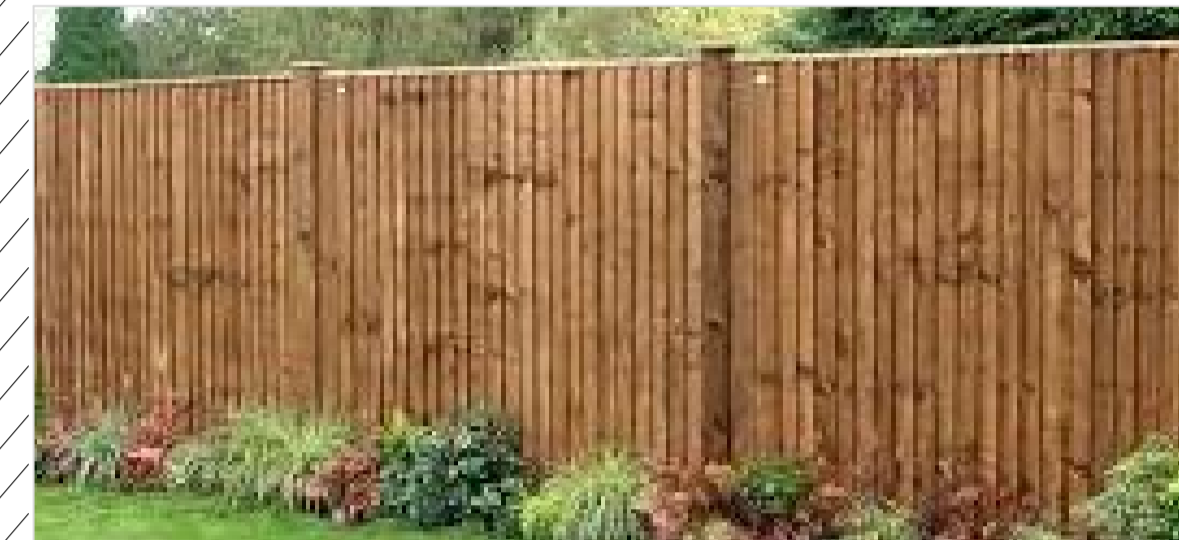
PHOTO OF TYPICAL CLOSEBOARDED TIMBER FENCE

notes this drawing and design is the copyright of aja architects llp and must not be reproduced in part or in whole without prior written consent. contractors must verify all dimensions on site before commencing work or preparing shop drawings. If in doubt ASK. Where this drawing contains any Ordnance Survey mapping material, it has been reproduced under license number 100052278. Ordnance Survey © Crown copyright 0m 50m 100m Scale