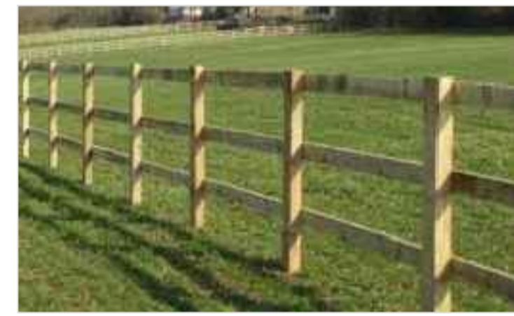
PHOTO OF TYPICAL POST & RAIL TIMBER FENCE